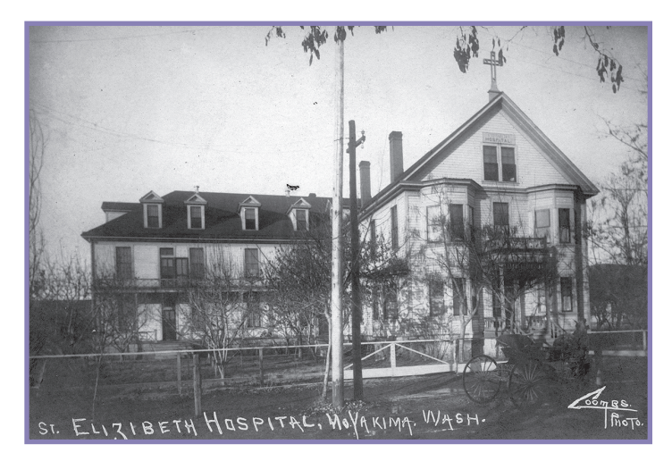
Photograph of St. Elizabeth Hospital, Yakima, Washington, in the 1900s, as it would have looked during the 1912 smallpox epidemic described in the following account: