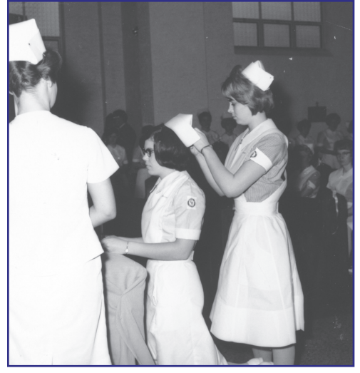
Capping ceremony at Columbus School of Nursing, Great Falls, Mont., 1966. (Image #84.E3.4) Inset: Nursing pins from Providence, Seattle (through Seattle College) and St. Vincent Hospital, Portland.

The committee left it up to the individual schools to use