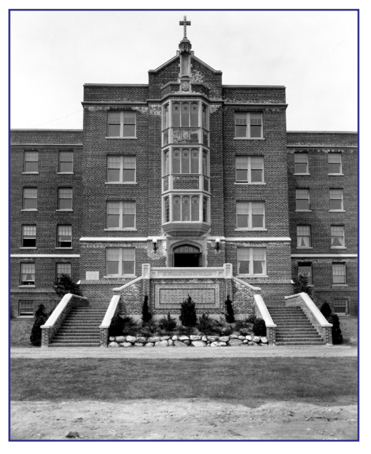
Entrance to what was then known as "St. Vincent's Home for the Aged," just after completion in 1924. Providence Mount St. Vincent, Seattle, Wash.

$Little Company of Mary Health Facilities in California