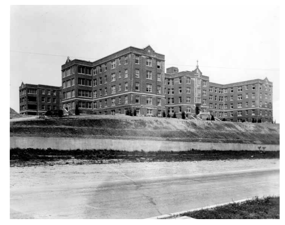
Providence Mount St. Vincent, Seattle, just after completion, 1924

Providence Regina House , Seattle, Washington