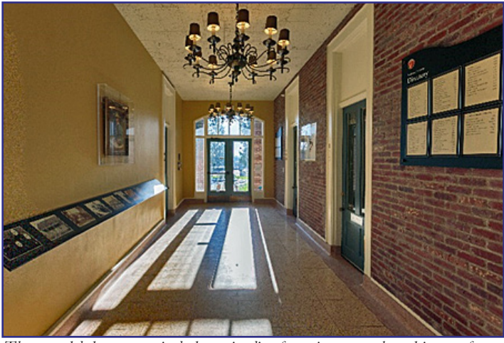
The remodeled entryway includes a timeline featuring research and images from Providence Archives, at left

Providence Health and Services maintains its close relationship to Providence Academy with tours for PH&S employees throughout the year;