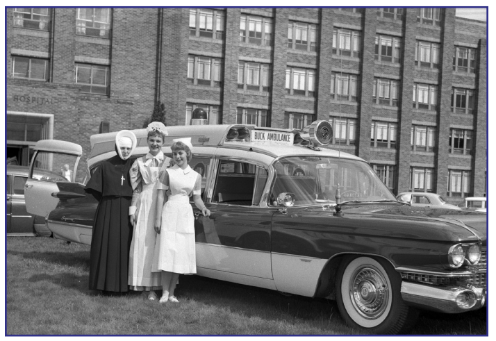
A Sister of Providence and nurses beside a modern ambulance, 1959. The hospital was celebrating the Oregon Centennial; the nurse in center dons a vintage uniform and "muffin top" cap