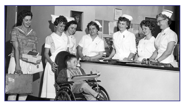
Nursing staff bid farewell to the first open-heart surgery patient at Providence Hospital, Portland, 1961. The young patient holds a "Rocky & His Friends Cartoon Kit"