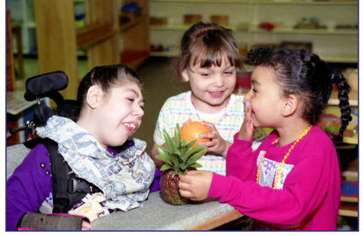
Having fun with fruit, 2000: Providence Child Center brings children with diasabilities and Montessori School children together for fun and learning