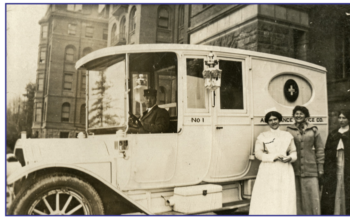
Nurses with ambulance in front of St. Vincent Hospital, Portland, ca. 1914