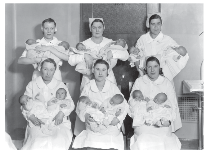
The Yakima sextet at St. Elizabeth Hospital (now Providence Yakima) consisted of two pairs of girls and four pairs of boys.

A couple of decades later, due to changes in health care policies and the desire for a full-service facility, the hospital was spurred to open obstetrics and maternity services once again. The Family Maternity Center opened in 1992 and was the first to bring state-of-the-art single-room maternity care to central Washington. Expectant mothers could now go through labor, delivery, recovery and post-partum in spacious, comfortable suites.