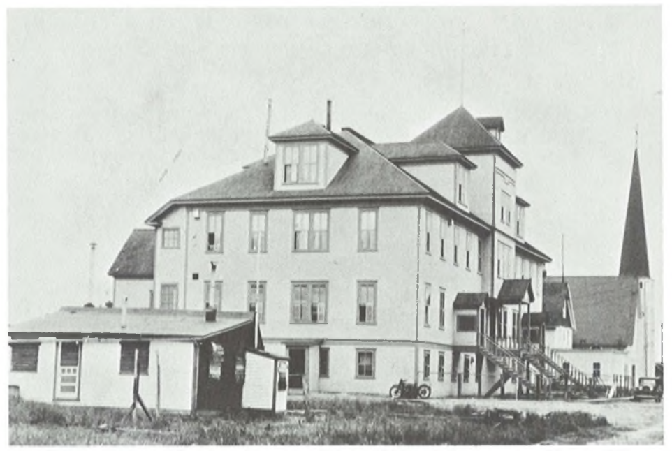
Holy Cross Hospital. After the sisters left in 1918, this became an office building c. 1920.