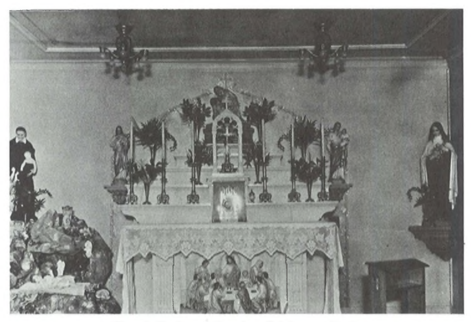
Chapel, St. Joseph Hospital, Fairbanks, Alaska.

By May of 1907, the chapel was completed and the sisters moved in for Mass and time of quiet prayer. The walls were white with a pale green trim, and above the gold and white altar, a statue of Our Lady of Seven Dolors stood in a niche. Just like the Motherhouse!