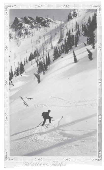
A Lourdes academy student skiing the mountain slopes above Silver Valley, Idaho, c. 1932.

"Those who are surfeited, as we may say, with the good things of their Father's house... cannot understand the hunger of heart felt by those who must be satisfied by the crumbs... Yet perhaps these crumbs bring as much joy to us as the abundance brings to others."