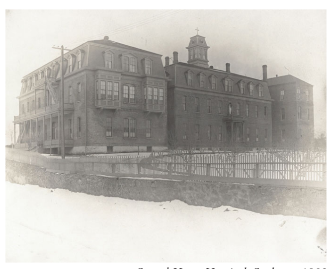
Sacred Heart Hospital, Spokane, 1903