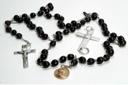
Costume beads, pectoral cross and silver ring received by Sisters of Providence at various stages of formation prior to the 1960s.

The application process was simple and included a letter requesting permission to enter, stages a one-page application form, a physical, and a character reference from the parish priest. Once accepted, the young women entered at one of