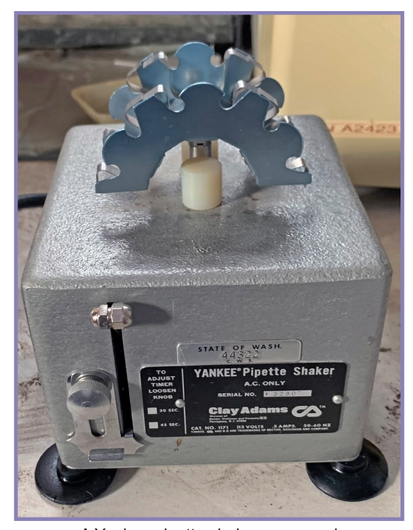
A Yankee pipette shaker recovered from Astria Medical Center

The largest artifact they retrieved was one of the original, beautiful mahogany interior doors with oval glass windows and hand painted room numbers. They chose room 326 - this door had the least amount of damage and modifications. However, after unscrewing the hinges and loading it on the cart, they discovered that the elevator was not working, so they carried the seven-foot door down three flights of stairs, which is a difficult job even without all the laughter!