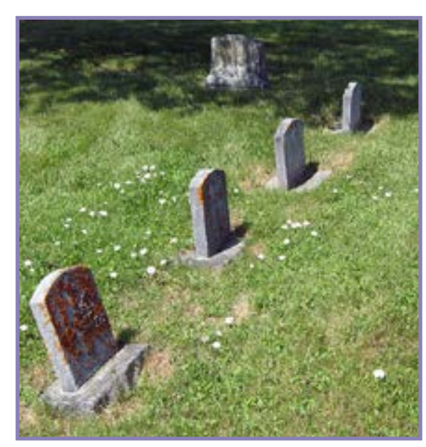
Headstones covered in lichen, St. Ignatius Cemetery

to look for any significant historical information, especially something associated with St. Ignatius Province or the Montana ministries. In the end, six headstones were selected, bringing the collection to a total of eight.