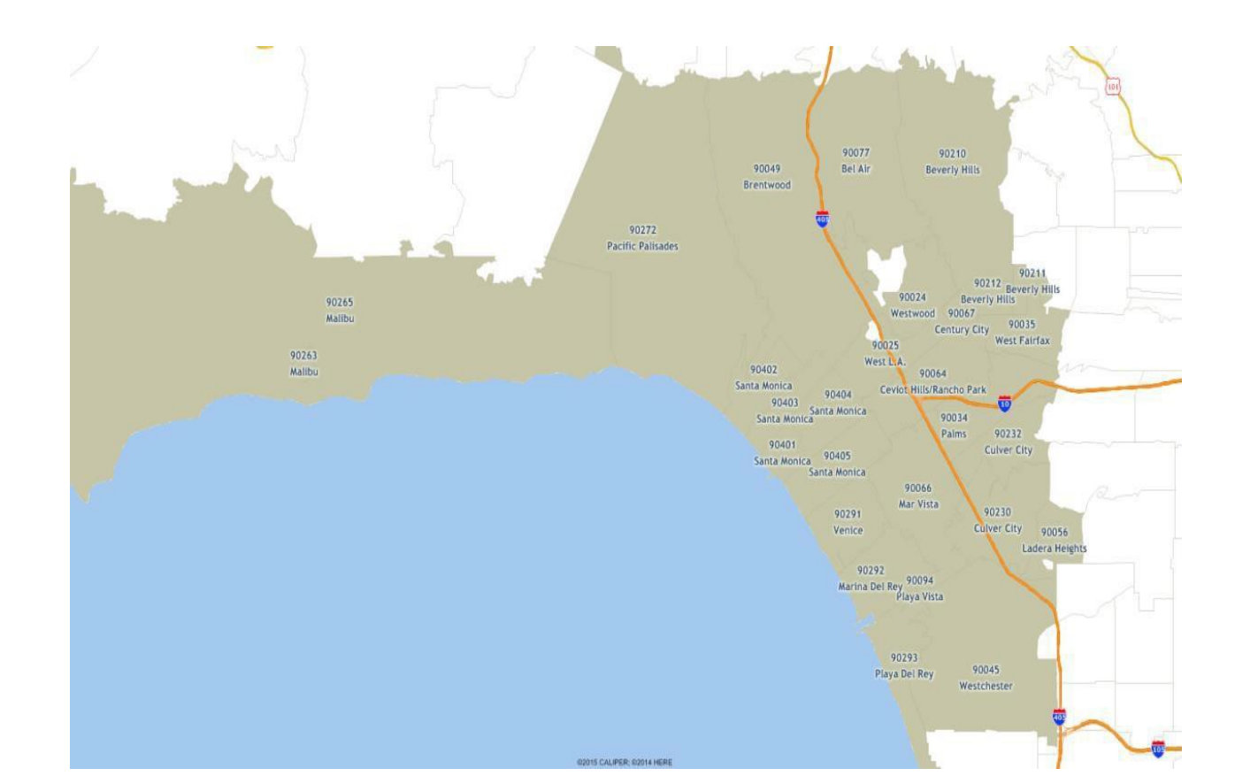
FIGURE 3.1: MAP OF SAINT JOHN'S HEALTH CENTER SERVICE AREA